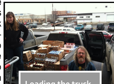
Loading the truck

receive no extra food as is the month of January. In desperation I called Jandyl, our Member Service Coordinator from 2nd Harvest, who so graciously worked with us to restructure our account with them, realizing we qualified to receive more food than we were previously set up for. She also connected us with local "food rescue" sources where we now pick up from weekly when they have excess usable food.